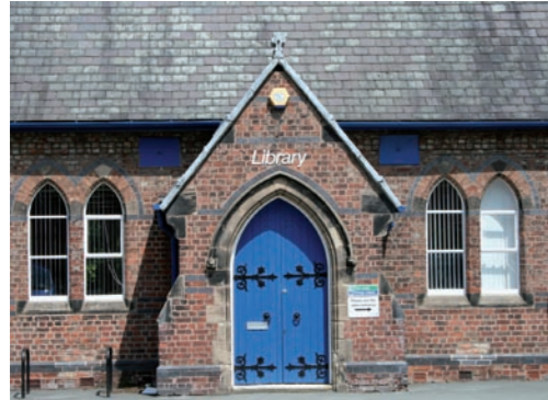
to Library and Citizens Advice Bureau, also Lymm United Reform Church

A few steps and a short stride from here will take you to the village centre, with pubs, cafes, restaurants, shops, and relaxing walks in this historic setting.