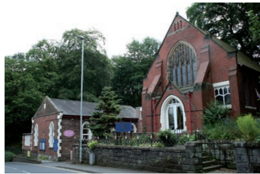
to Lymm Methodist Church